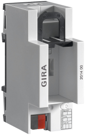
KNX USB data interface 2014 00